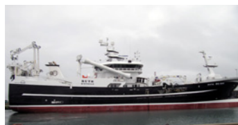
The Ruth, Denmark's new flagship pelagic vessel, with Ibercisa electric winches delivered by KSS.

The newfound success of Klaksvík's repair yard is getting noticed as KSS continues to deliver at the highest standards of quality, including advanced variable-frequency controlled winch systems for top-notch fishing vessels in the Faroe Islands and elsewhere.